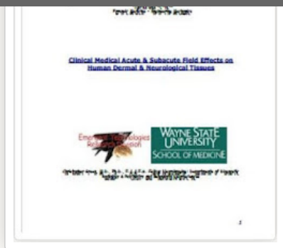
Final version of Green's paper, before it was turned into an official DIRD