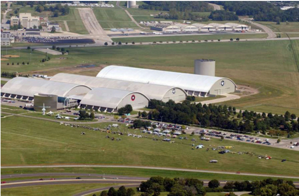
The Air Force Materiel Command is headquartered at Wright-Patterson Air Force Base.

It is surprising enough people in the government would be working with DeLonge on a UFO project, but it is even more surprising what he says they have told him. DeLonge says he based his recent fiction book, Sekret Machines Book 1: Chasing Shadows , on the information they fed him. The book is about the government's decades long project to back engineer alien technology and hide it from the public.