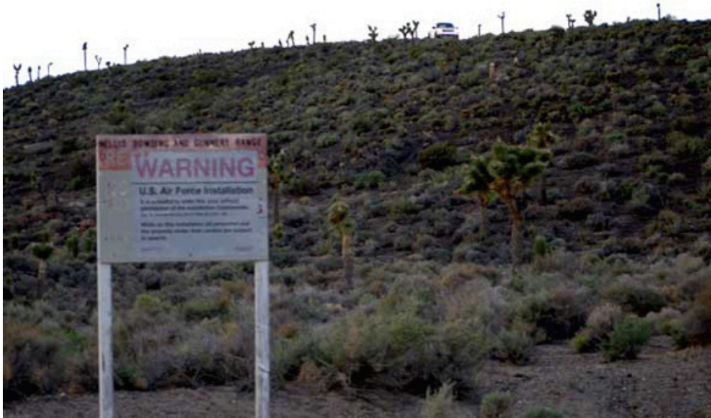
Warning signs at the Area 51 back entrance.

However, now that the leaks are done, and looking more closely at the UFO emails, it is not just shocking that these men attended a meeting about UFOs, but, apparently, one of the USAF generals has been advising DeLonge on his project to reveal the government has back engineered alien technology. DeLonge has even implied that the general told him the U.S. had found an alien body.