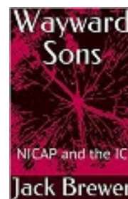
WAYWARD SONS: NICAP and the IC

The White House called on the State Department, CIA, and the Pentagon to secretly investigate the microwave assault. This directly resulted in DARPA Program Plan 562, now more widely known as Project Pandora, an exploration of the behavioral effects of microwaves.