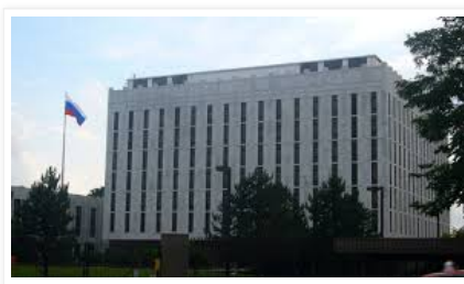
Embassy of Russia, Washington, D.C.

History shows us a new embassy in Washington was built in the 1970's and 1980's for the Soviets, later referred to as the Russians. The FBI and NSA jointly executed a several hundred million dollar plan to construct a secret tunnel beneath the building for spying purposes. Basically, the tunnel was for eavesdropping.