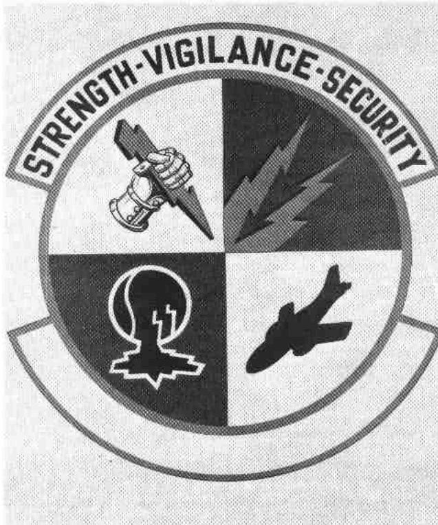
773rd Radar Squadron unit symbol

his speech, "The 773rd Radar Squadron had consistently met mission requirements using one of the largest and technically most sophisticated aircraft detection radars ever developed. It was the last of its type left in the Air Force."