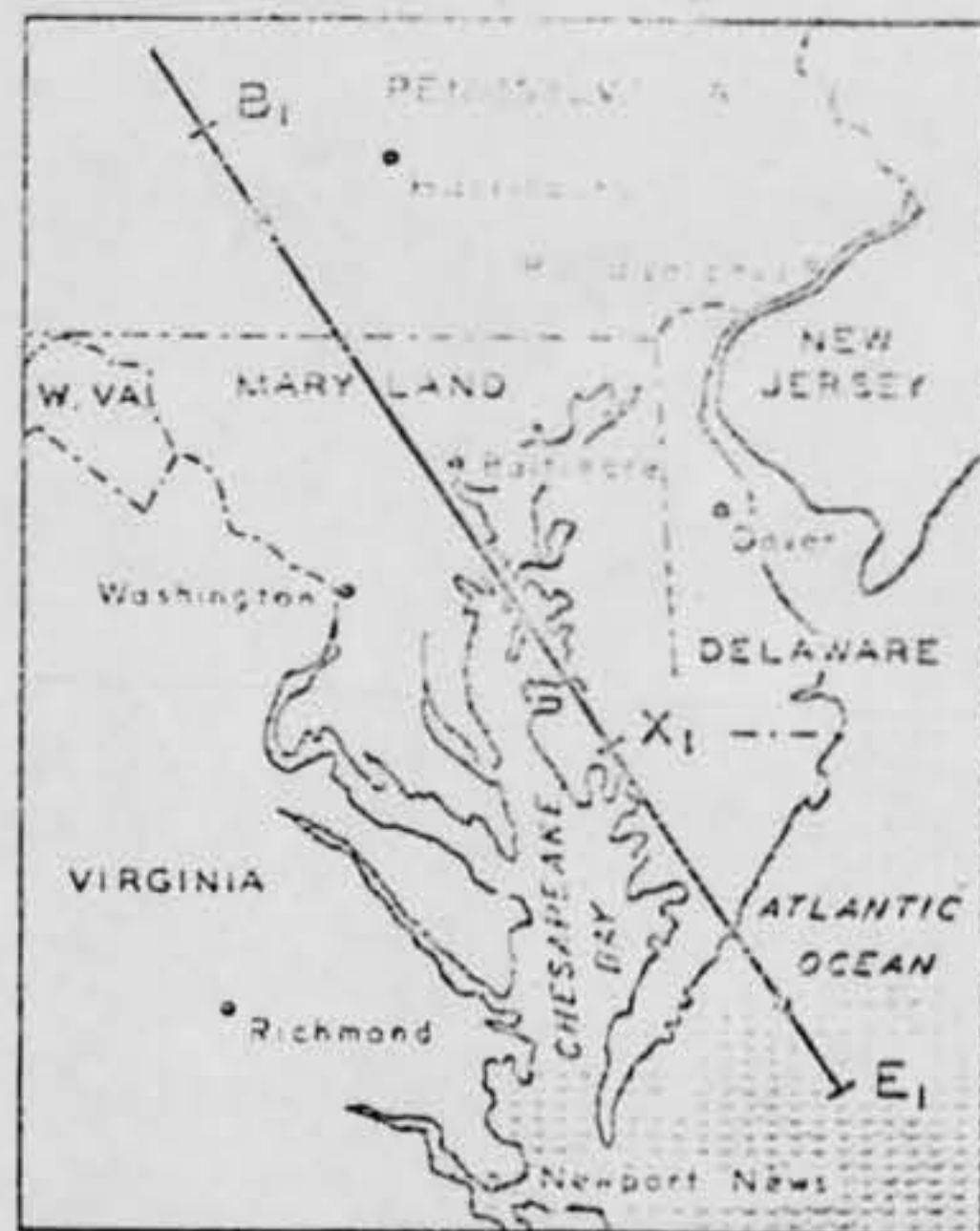
The fireball of March 25, 1963, passed southeastward from Pennsylvania across Maryland to end over E_1 , after exploding above X_1 . Diagram by the author.

A striking explosion of the fireball occurred above point X_1 , as the main body partially disintegrated. Apparently there were at least two more flares farther along, but not so great or brilliant. The "sparks" from the explosion were orange or red. An observer at Newport News, Virginia, said that a dozen or more fragments followed the meteor. There is good